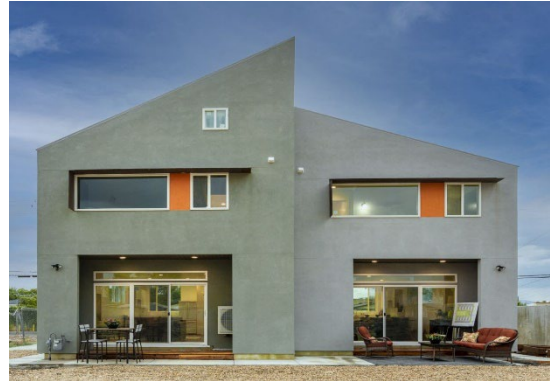
Twin homes facing the future Field of Dreams Park

Habitat for Humanity is known for building decent, affordable homes that give low-income families a path to stability and upward mobility. Our Field of Dreams project is an eco-community of 20 high-efficiency twin homes in Kearns, Utah. What sets this neighborhood apart is a central community park, providing a safe, welcoming, and culturally relevant space where children and families can spend healthy time together outdoors and build community. The park will connect people, creating the social cohesion that makes communities thrive.