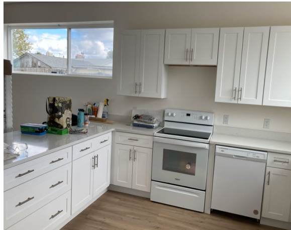
The homes are highly energy efficient and have low maintenance, making them affordable in the long run.