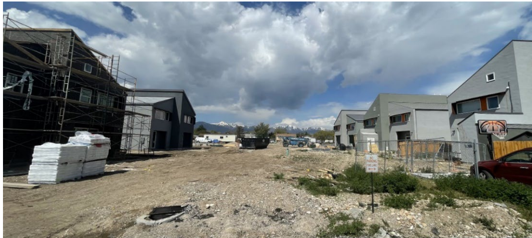
May 17, 2023. Phase 1 area, looking west. On the right are four occupied homes (with 11 children), followed by two that are almost finished. On the left, four homes are under various phases of construction.