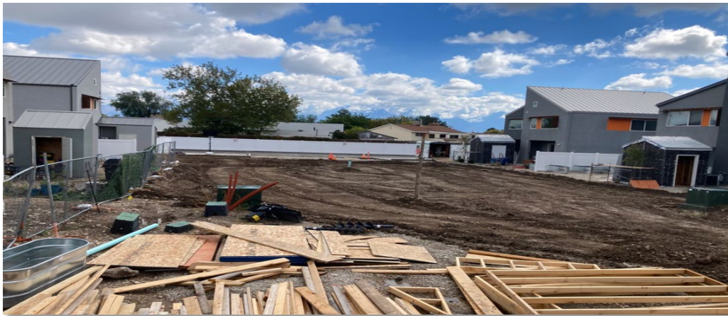
October 10, 2023. The park area being graded for the playground equipment.