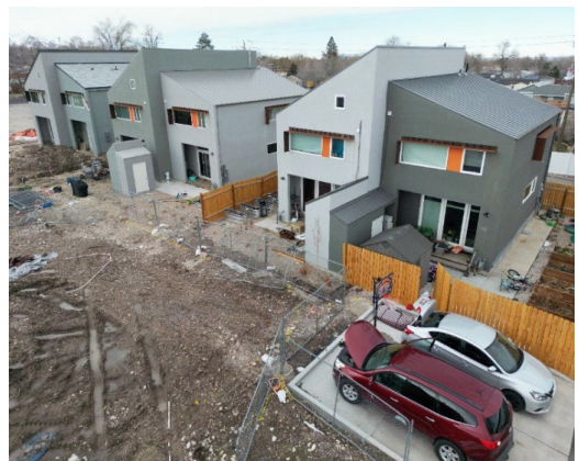
March 10, 2023. Right to left: four occupied homes (with 11 children), two under construction.

Put Your Name on the Field of Dreams! Donate at: habitatsaltlake.com