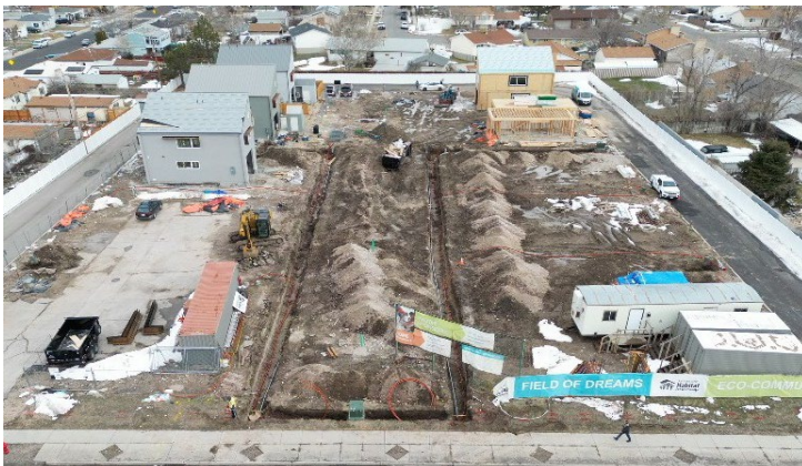
March 10, 2023. View of the park site, from the west, facing east. Phase 1 is furthest away.