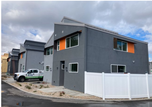
October 10, 2023. The two newest homes being dedicated on November 8, 2023.