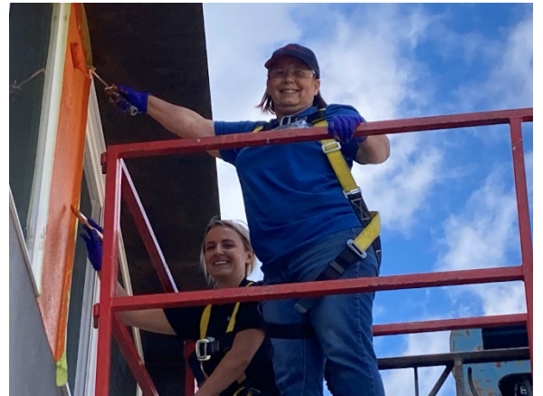
Volunteering and building sweat equity!

Since 1986, Salt Lake Valley Habitat for Humanity (Habitat) has been building affordable and decent homes, making critical home repairs, and operating our ReStore building materials thrift store. We have helped more than 100 low-income families become first-time homeowners, breaking the cycle of intergenerational poverty. Over 600 people have benefited from our Critical Home Repair Program, which mitigates health and safety issues. Thousands of people shop at our ReStore annually for low-cost household items, appliances, furniture, and home improvement materials. The ReStore keeps 681 tons of repurposed material out of landfills each year! As a highly collaborative organization, we leverage our resources in partnership with those of the government, nonprofit and for-profit agencies, and our sister Habitat affiliates across the state of Utah.