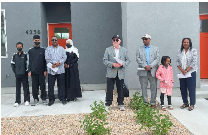
June 14, 2023. Home dedication for two families, with three children.

Put Your Name on the Field of Dreams! Donate at: habitatsaltlake.com