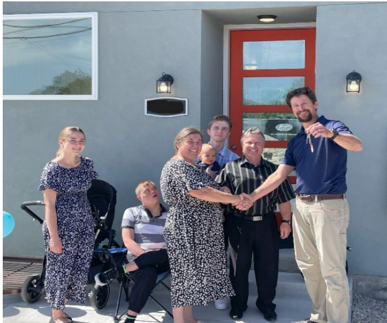
May 31, 2023. Home dedication for two families with nine children.