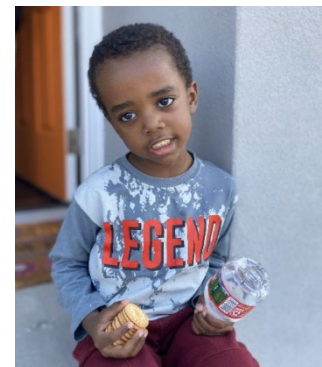
A happy Field of Dreams child

Ten families, with a combined 26 children, live in the Field of Dreams community. The remaining 10 families have been selected and are working on their sweat equity hours! The children are very excited about being able to play in their new park!